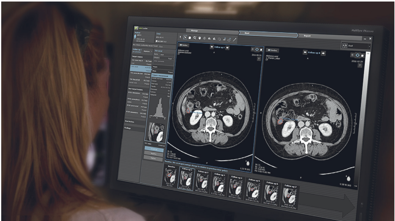
Software screenshot of mintLesion™

mintLesion™ image analysis software streamlines imaging and clinical data evaluation for clinical trials and research in accordance with standardized response criteria comparing medical images from multiple modalities across time points. Multiple workflow options are available in mintLesion™ including Single and Double Reads, Adjudication, Eligibility, and Consensus Review.