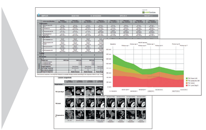
Use case 1: Therapy evaluation with mint Lesion (e.g. in line with RECIST)

For lung tumor staging with the TNM classification, other specific requirements exist. Here, the categorization of the observations is distinguished as primary tumor, lymph node and metastases.